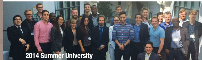
2014 Summer University